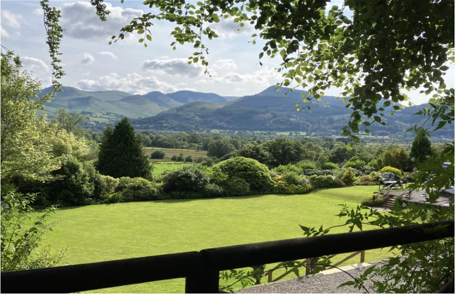
towards Cat Bells -in the Lake District