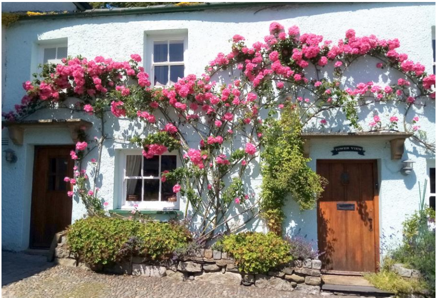
Cottage looking across to Cartmel Priory – Cumbria