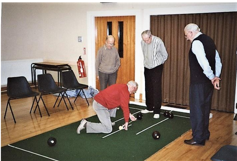
2003. A well-played game of indoor bowls enjoyed by the men.