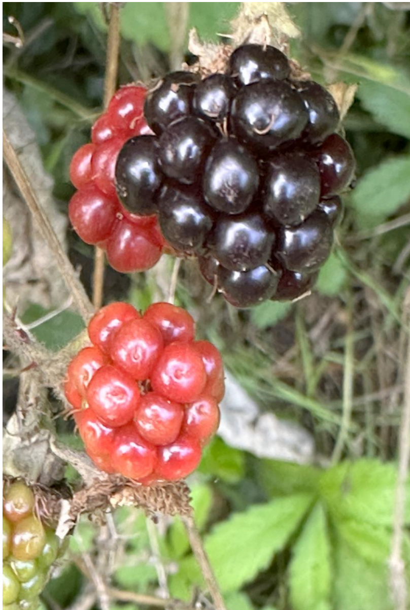
Tasty Summer Blackberries