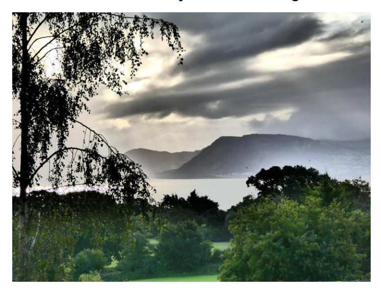
Using "Impressive Art"