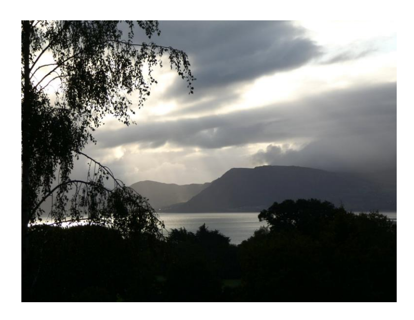
Taken with "Low Key" camera settings