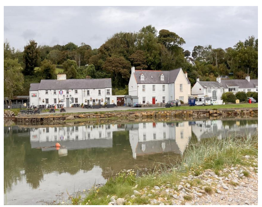
Red Wharf Bay - and reflection!