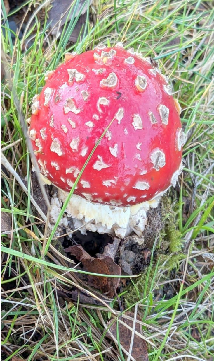
Fly Agaric Mushroom - found in Walmersley!