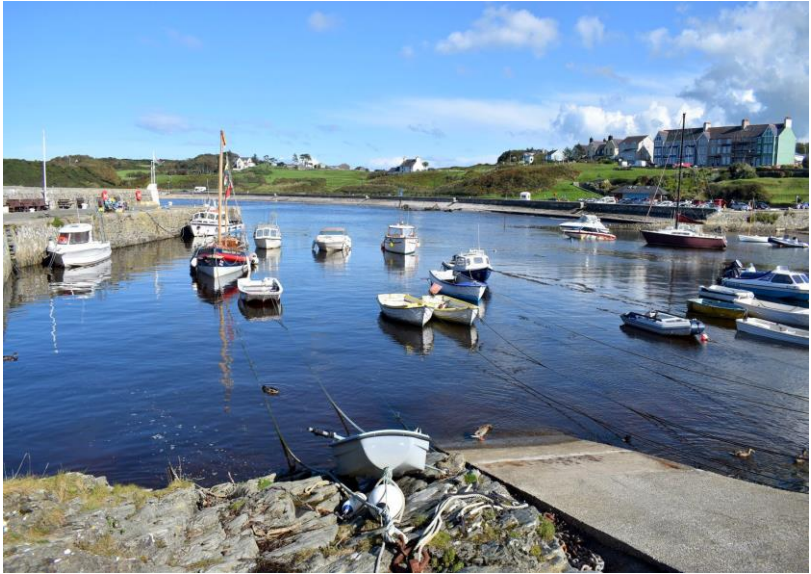
Bay at Amlwch, Anglesey