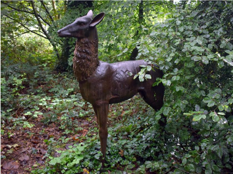
Metal Deer in the wood!