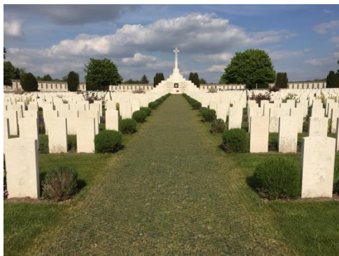
Tyne Cot Cemetery