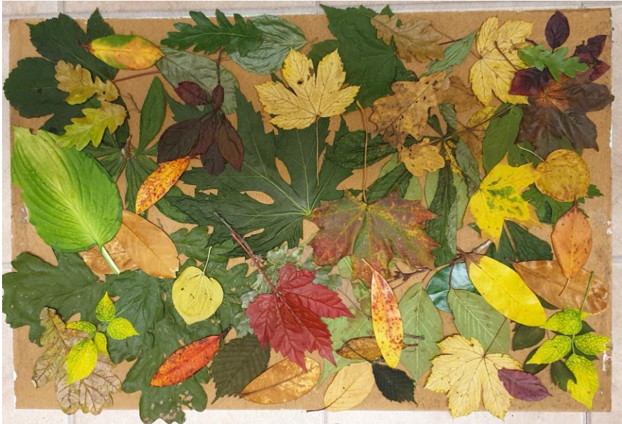
Camera Club Pictures of Autumn