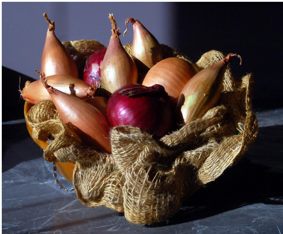
Camera Club picture.