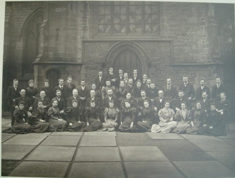
TEACHERS. BANK STREET SUNDAY SCHOOL, BURY.

By December 1891, there were 29 female teachers and 33 male teachers, 267 girls and 220 boys attended the Sunday School.