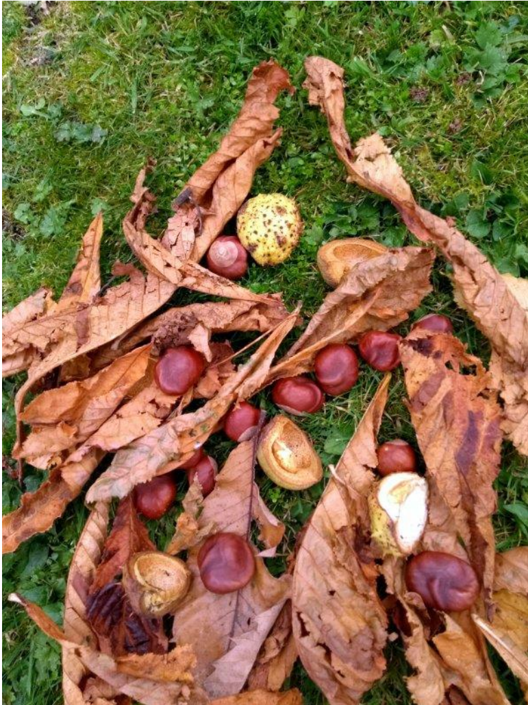
Camera Club picture