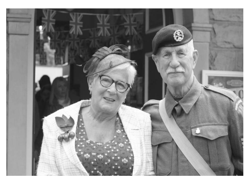
Recent Camera Club pictures from a new member!