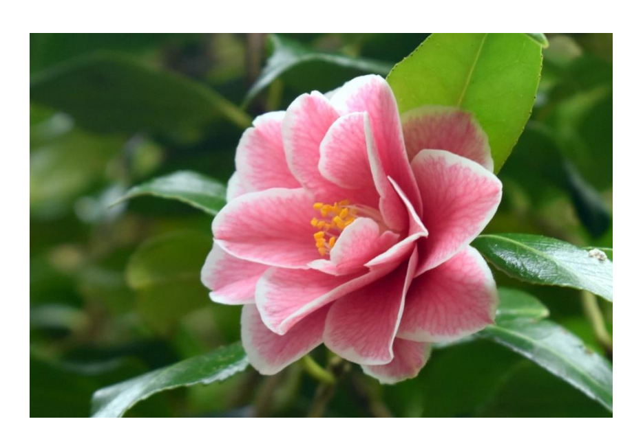
Its just a matter of Focus!