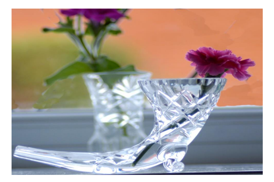
It's just a matter of Focus!