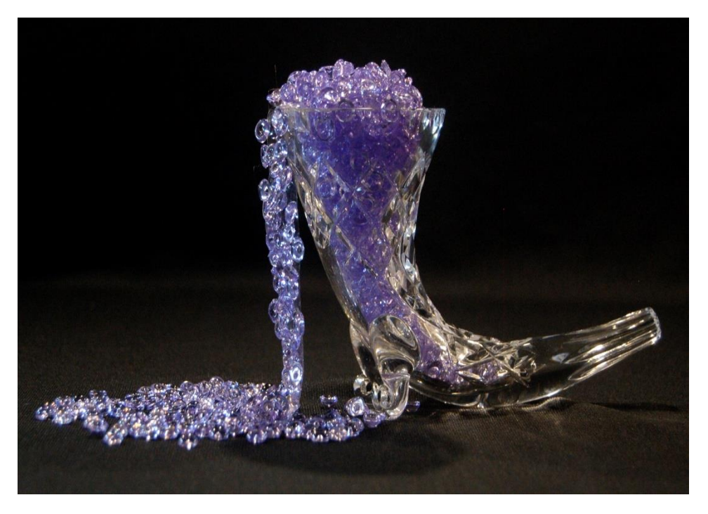
Recent Camera Club Pictures