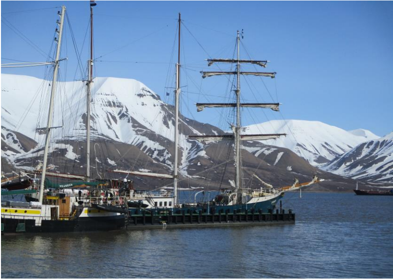
Sailing ships at Longyearbyen Norway