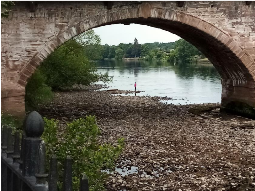
River Tay in Perth, Scotland