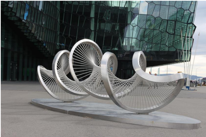
Sculpture in Reykjavik Iceland