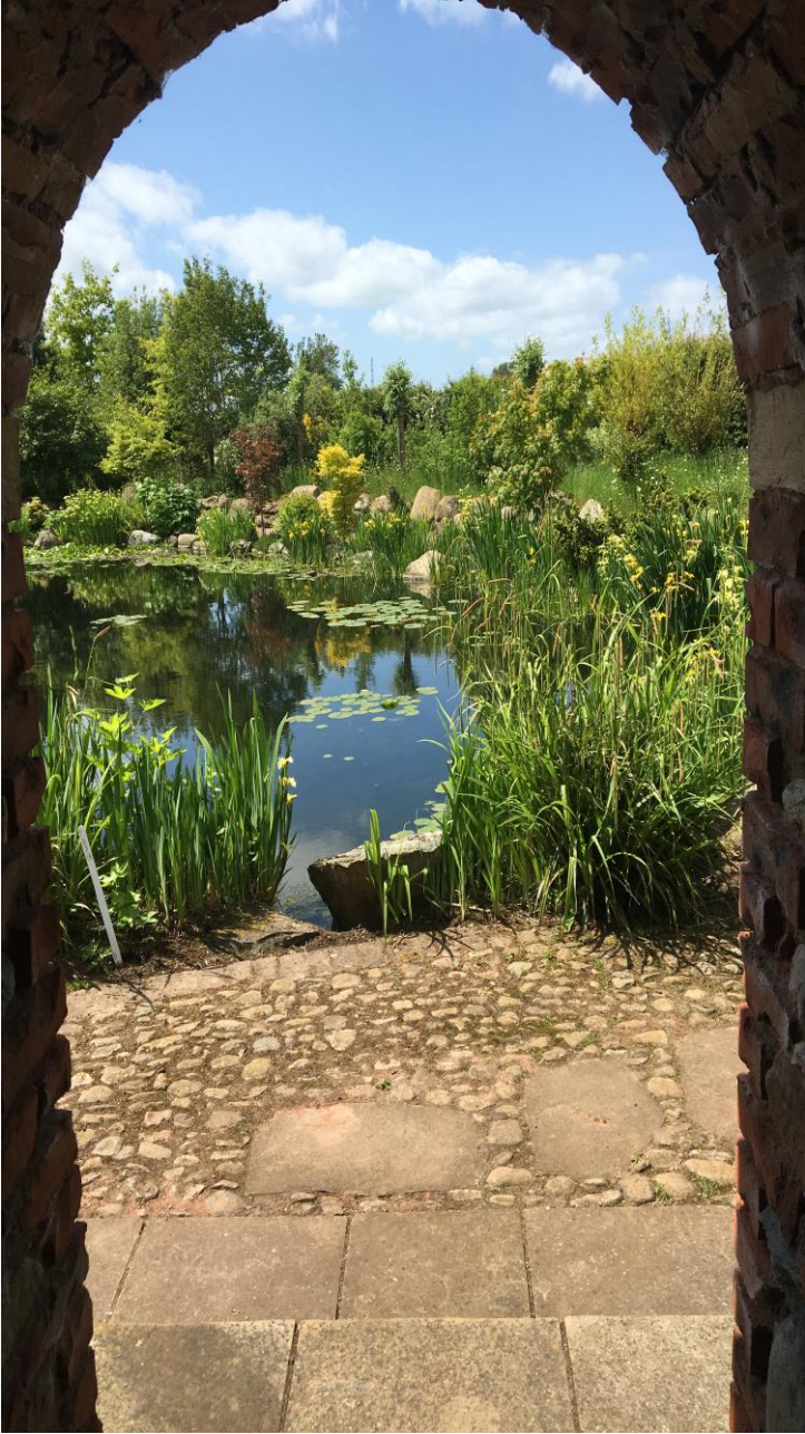
Larch Cottage Nursery, near Penrith