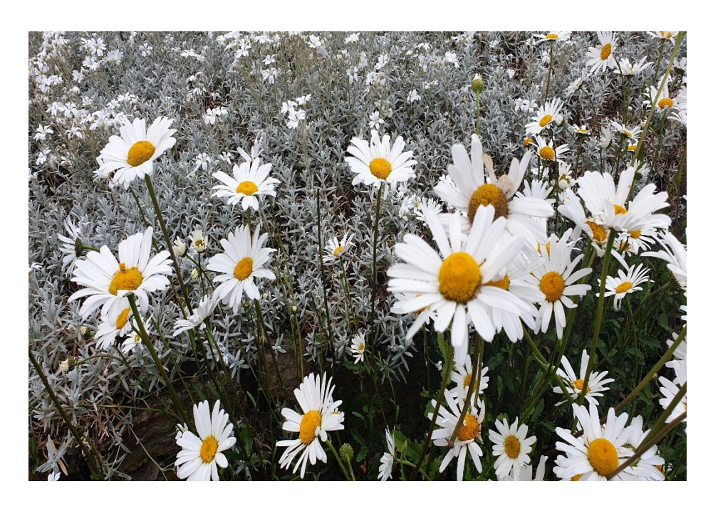
Bourton-on-the-Water – The Cotswolds