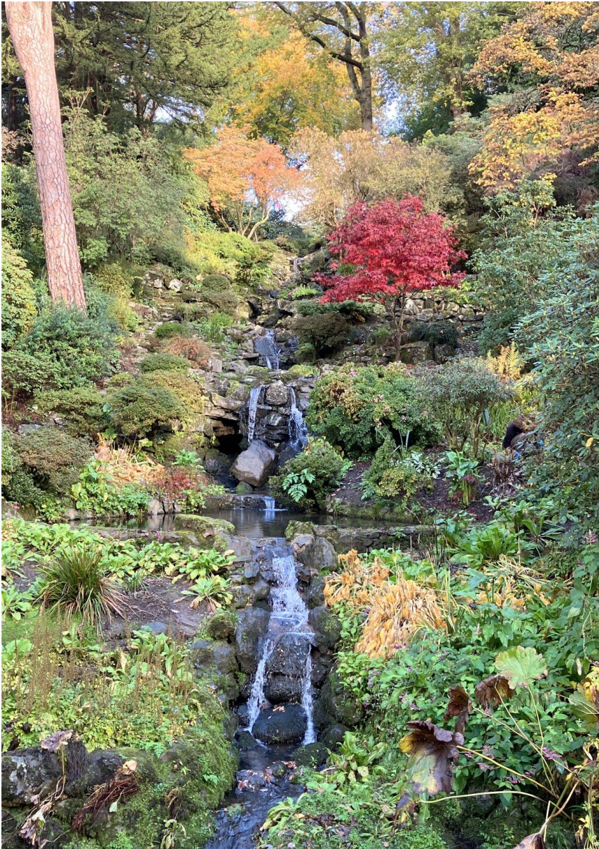
Bodnant Garden - Conwy