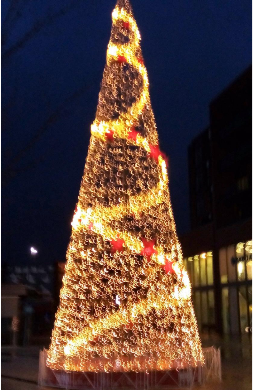
The Rock's best Christmas Tree