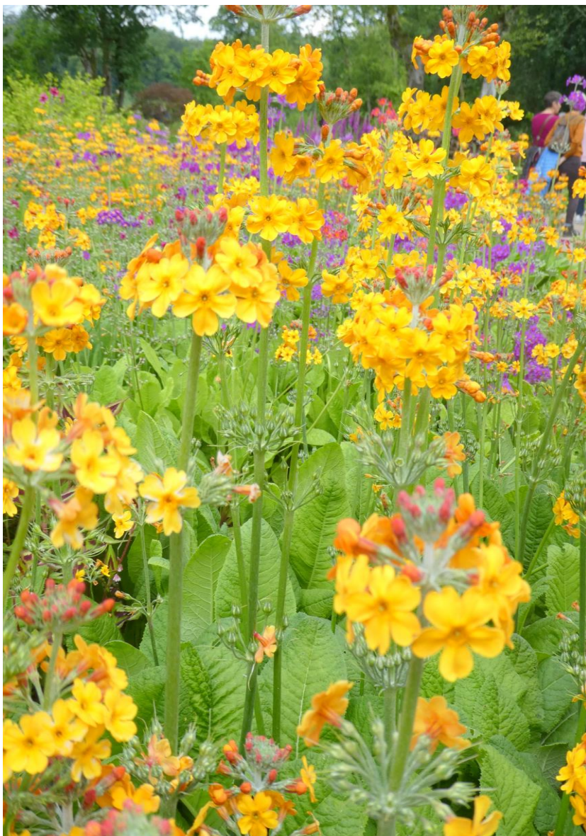
Primroses - a summertime splash of colour