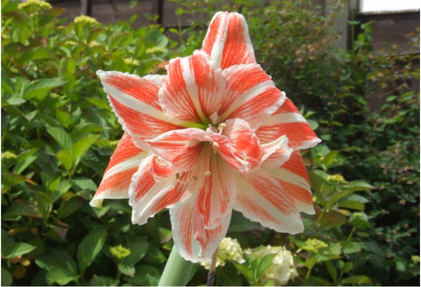
White and Red amaryllis flower