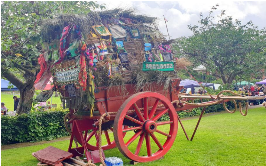
Littleborough Rush Cart