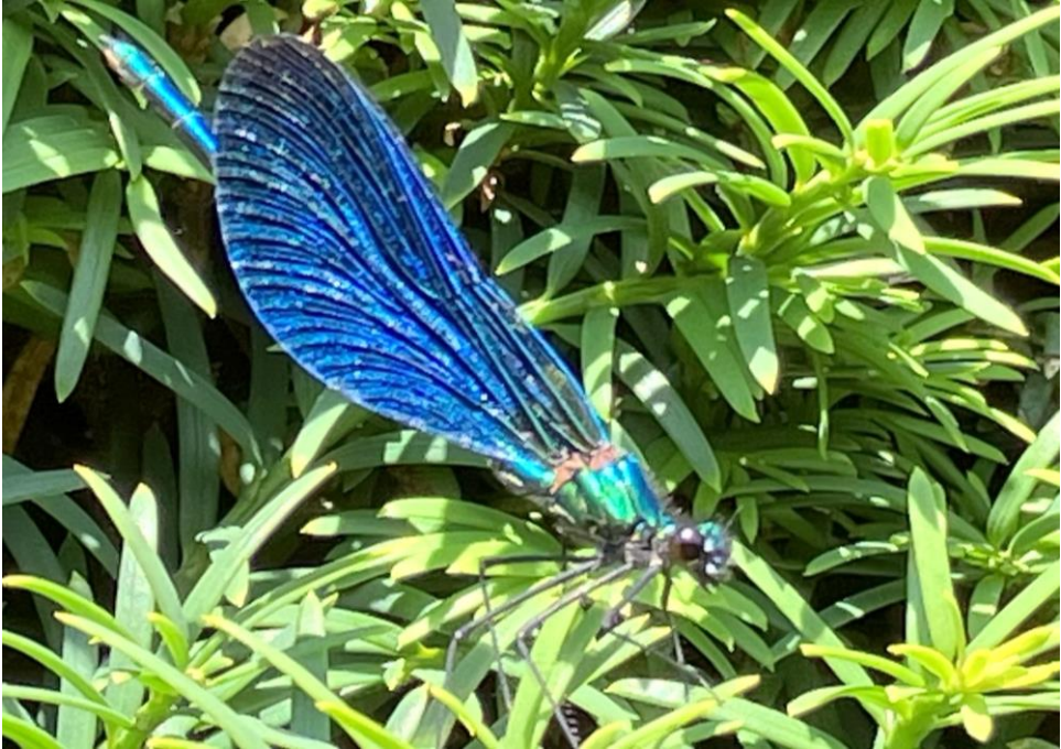
Beautiful Blue Damselfly