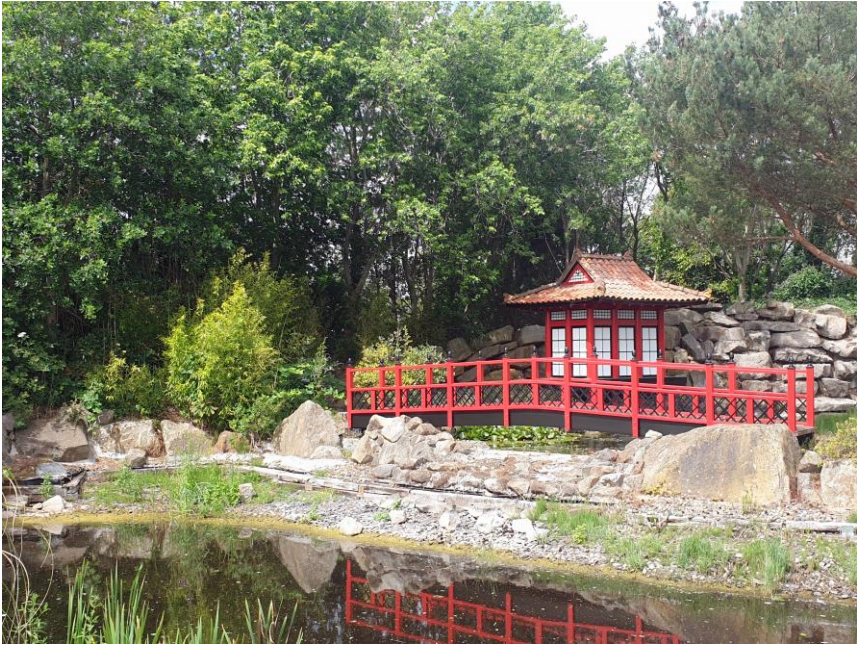
“Drainage Pond” in Lytham