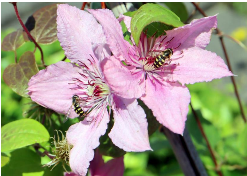
Clematis with busy bees!